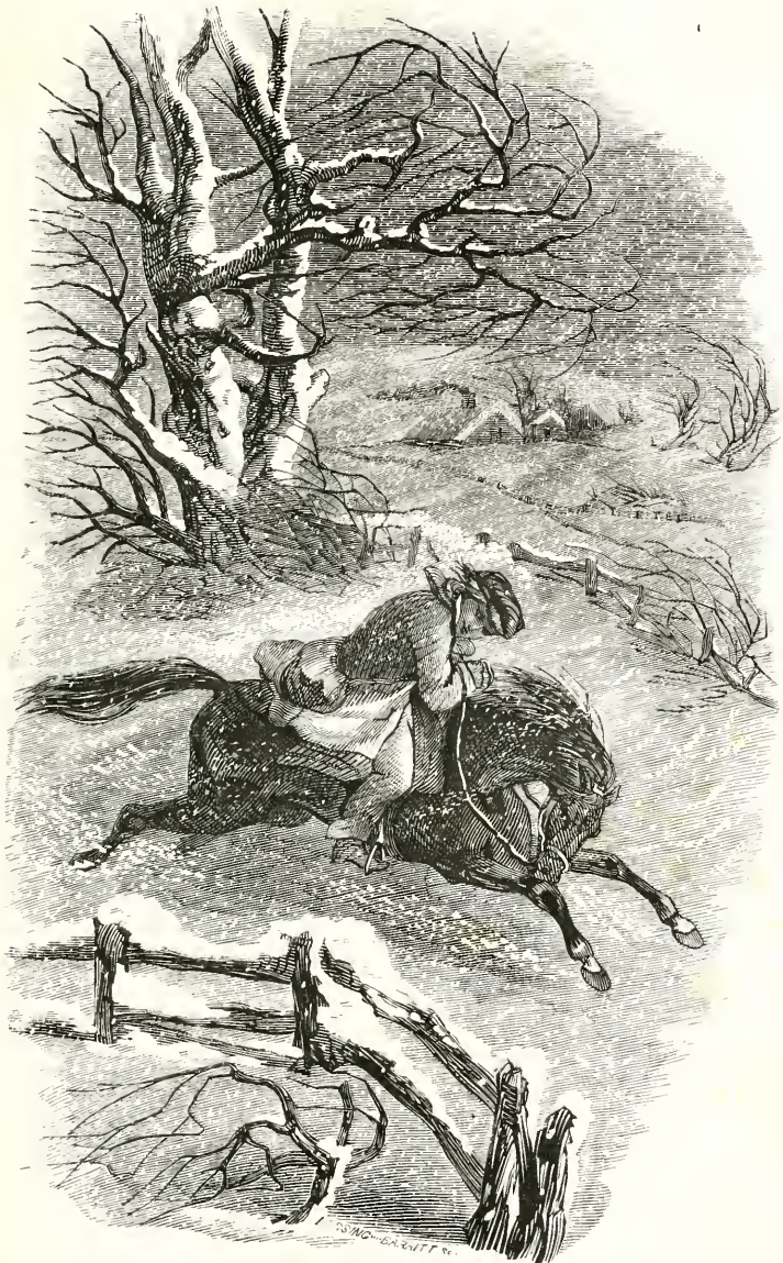
THE COLD FRIDAY. Vol. I, p. 394.